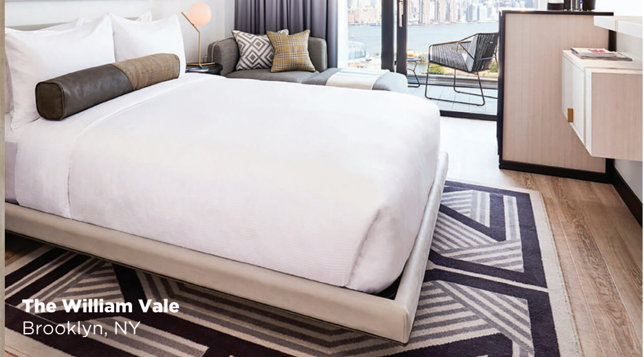
The William Vale Brooklyn, NY