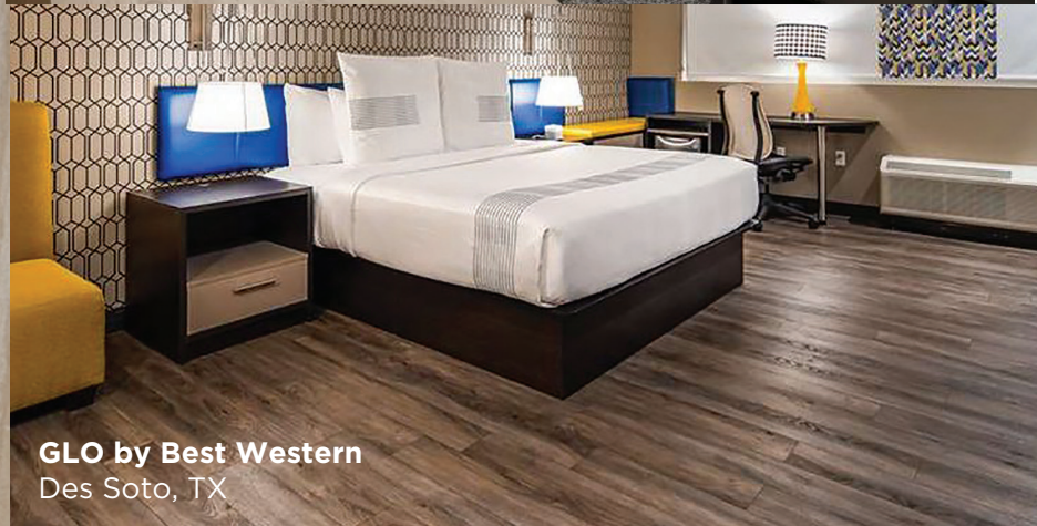
GLO by Best Western Des Soto, TX