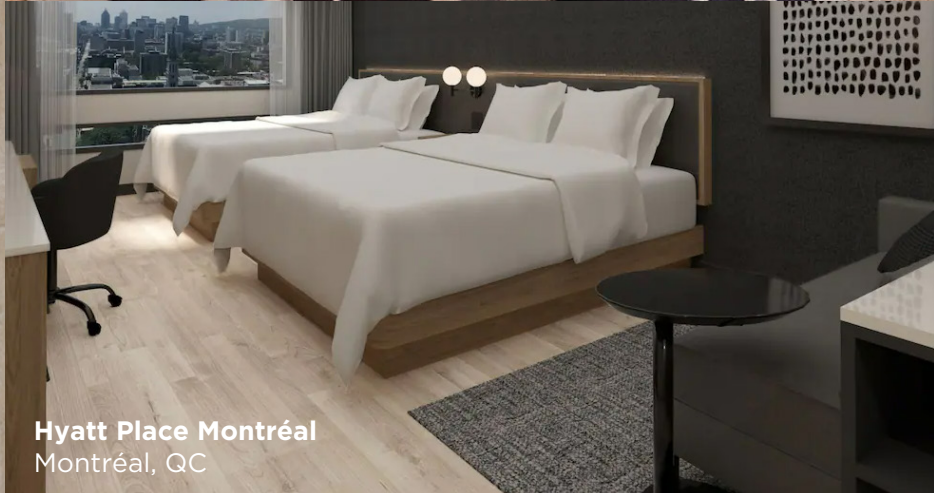
Hyatt Place Montréal Montréal, QC